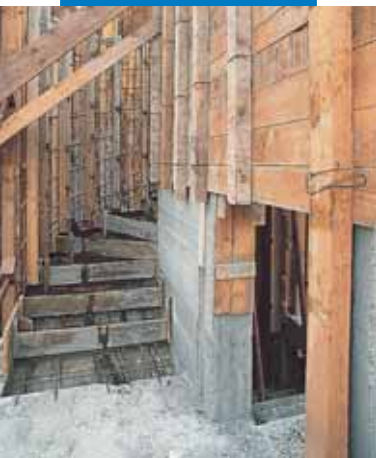
Examples of formwork treated with DMA 1000 Form Release Agent