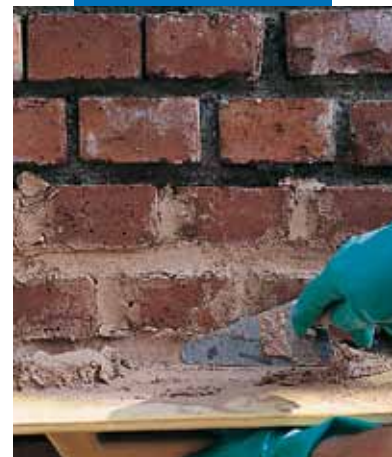
Pointing a brick work using Mape-Antique CC