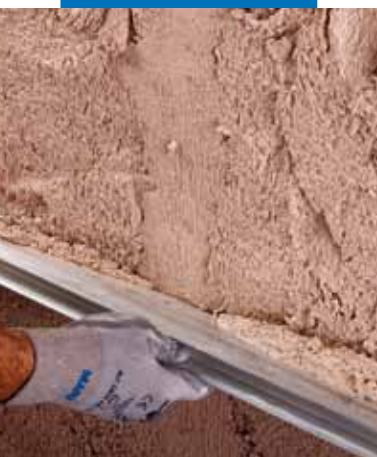
Flattening the surface of Mape-Antique CC with a straight edge