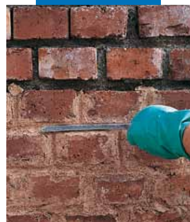
Finishing the joints pointed with Mape-Antique CC