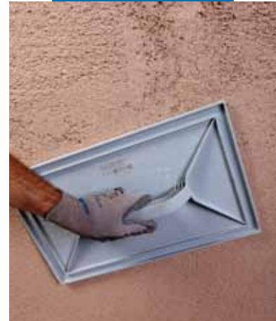
Levelling the surface of Mape-Antique CC