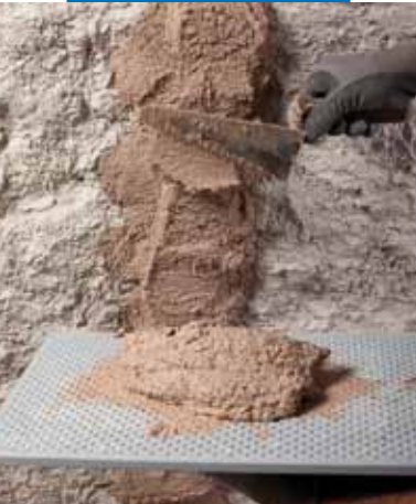
Preparation of levelling strips