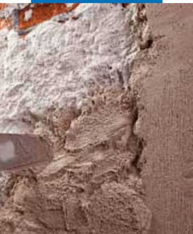
Application of Mape-Antique CC over Mape-Antique Rinzafo