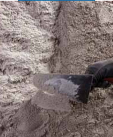
Applying Mape-Antique MC over Mape-Antique Rinzafo