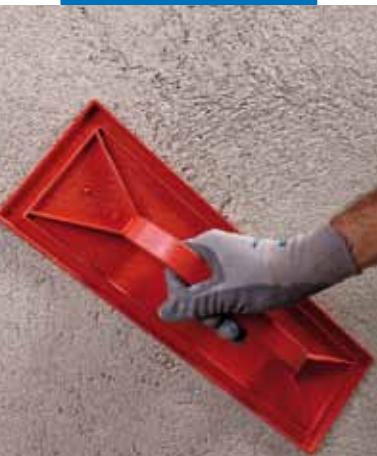
Levelling the surface of Mape-Antique MC