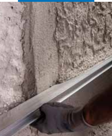
Levelling the surface of Mape-Antique MC with a straight edge