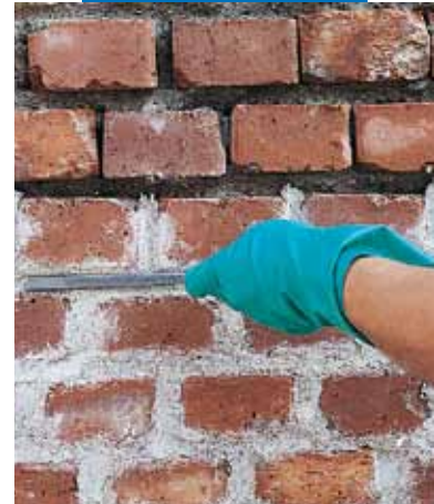
Finishing mortared joints pointed with Mape-Antique MC